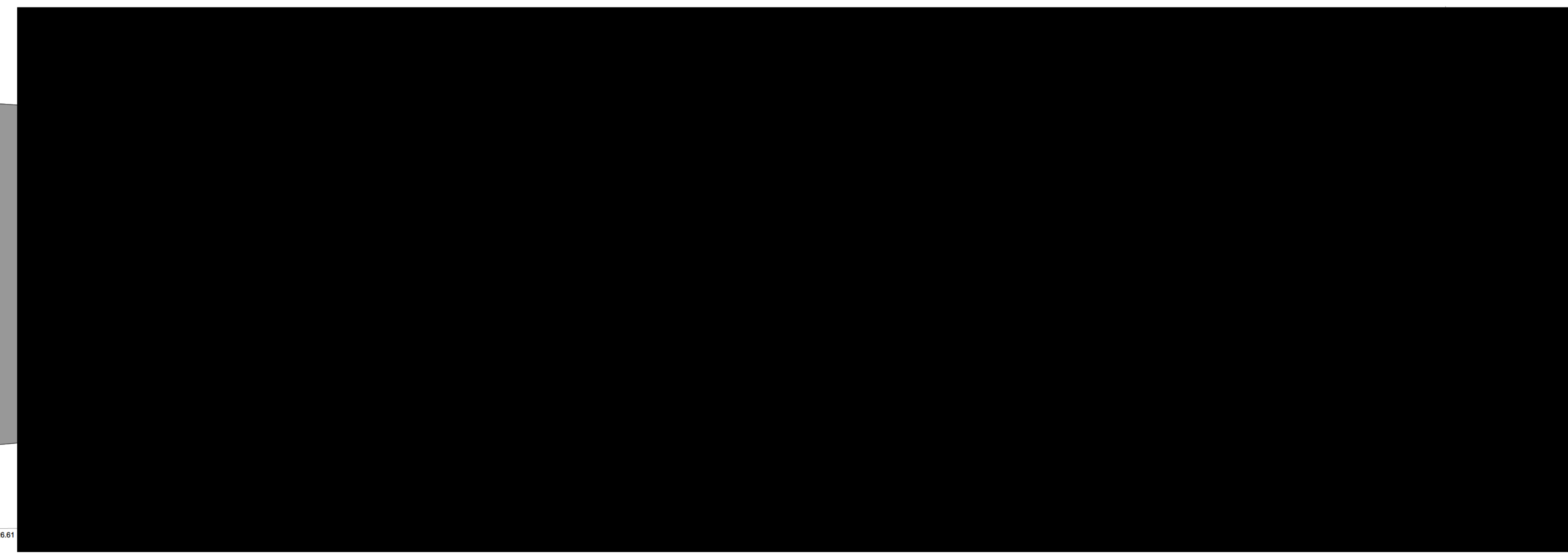
PLAN MASSE - PROJET Ech : 1/100