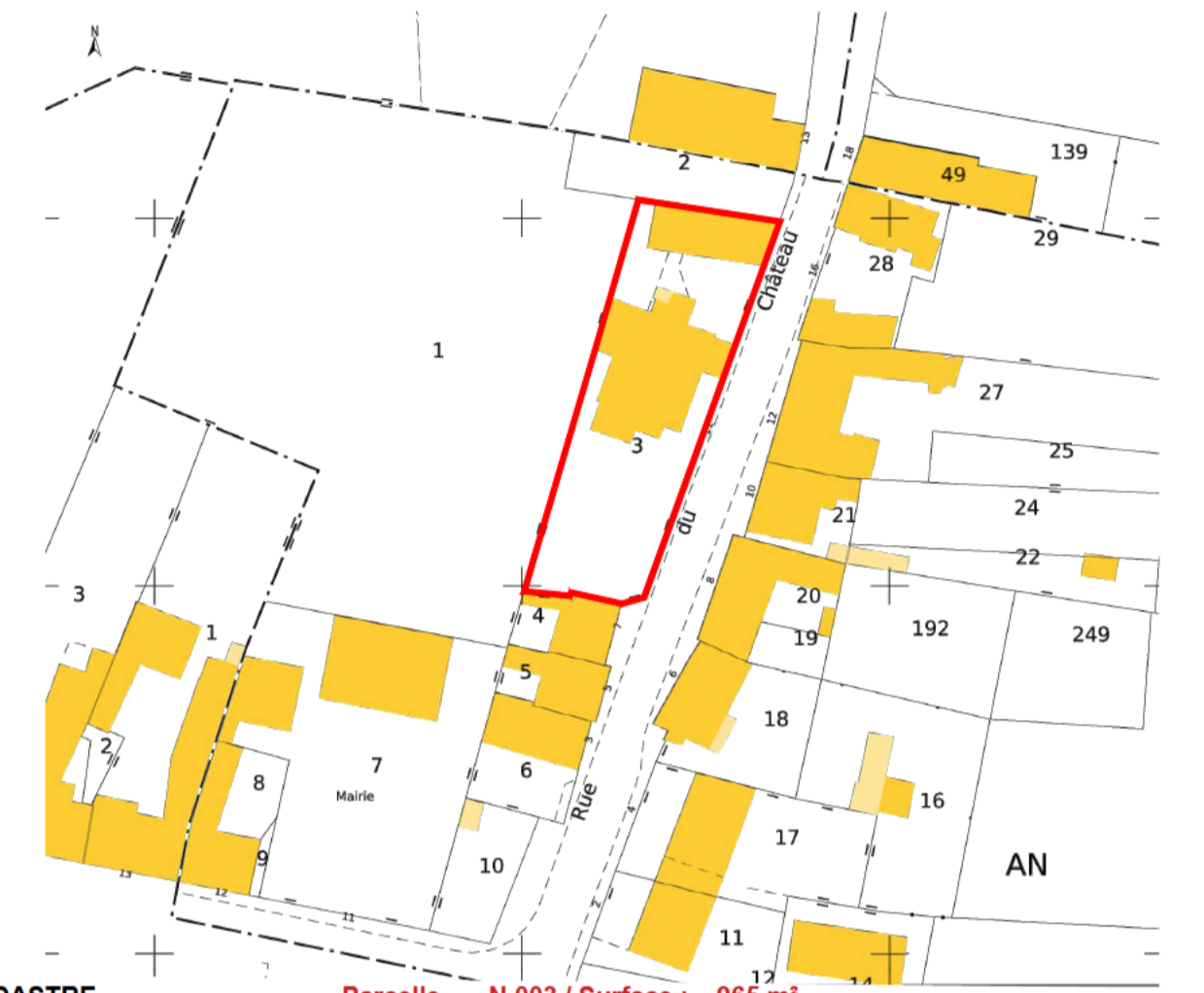
PLAN DE CADASTRE Ech : 1/1000